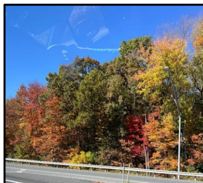
Colorful trees on the NJ Turnpike