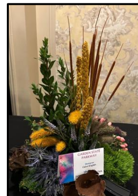
Garden State Parkway