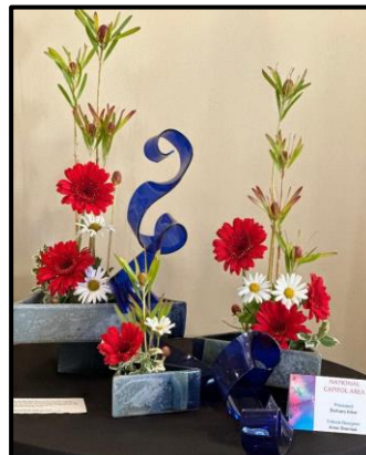
National Capital Area