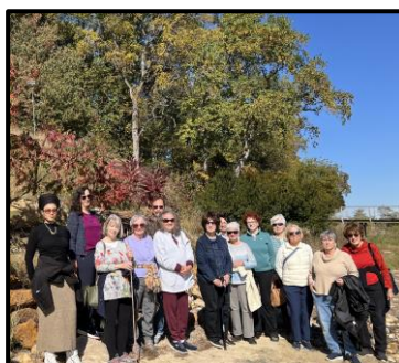
LDC shoreline tour

CAR-SGC CONFERENCE: Congratulations to New Jersey for a successful 2024 conference. Save the date for October 19-21 (bus tour on 22 nd ) for the 2025 Conference/Tri-Refresher to be held in Maryland. Hope you'll join us.