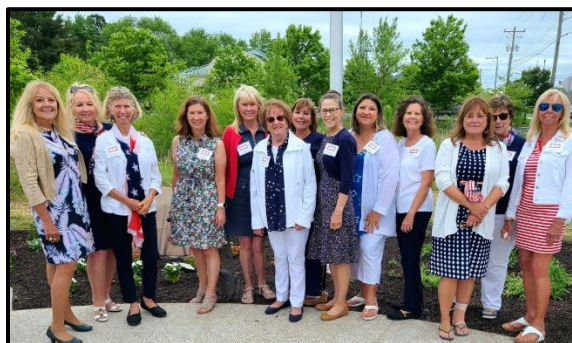
Salt Air Blue Star Committee

The new garden features a variety of perennial and annual plants to provide year-round interest and colors. The garden features Soft Serve False Cypress, Black-eyed Susans, Shasta Daisies, Gallardia , Vinca , Angelonia and trailing petunia. A bench donated by the Mayor of Ocean View was placed near the marker to provide an area for reflection. A lighted flagpole was also placed near the memorial. The Salt Air Gardeners designed, planted and maintain the garden. Members of area businesses donated their time and resources to prepare the site, create a walkway, and install the flagpole.