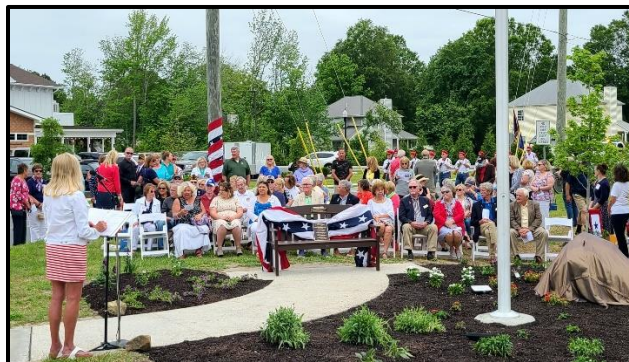
Salt Air Blue Star Ceremony

The Blue Star Memorial By-Way Marker dedication program was attended by members of the community, VFW Post 7234, the Mayor of Ocean View, Ocean View Town Council, State Representative Gerald Hocker, Salt Air Gardeners members, and representatives from Delaware Federation of Garden Clubs. A local high school student sang the national anthem, and a veteran shared a military tribute. The program was filled with respect, honor and gratitude.