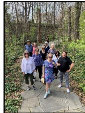
Landscape Design Council at Olmstead Woods at the National Cathedral

District and Club meetings were held inside, outside and on Zoom. Clubs and councils visited gardens and held plant sales. In April, we started a Flower Show School Series by holding Course 1. A few weeks later, six Student Judges tested to become Accredited Flower Show Judges. We continue to hold many flower shows!