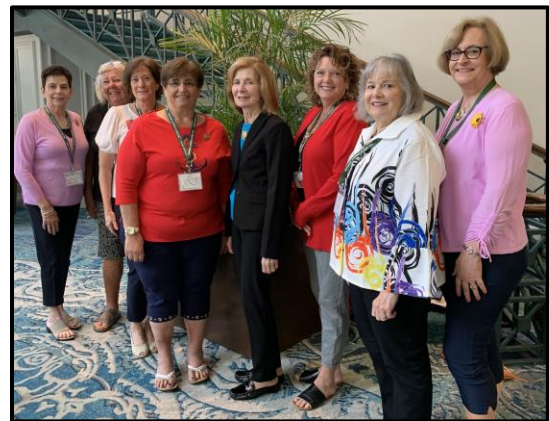
The CAR-SGC Presidents at the NGC Convention in Orlando in May