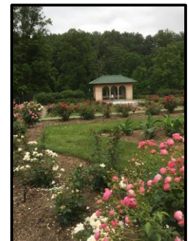
Roses at Hyde Park