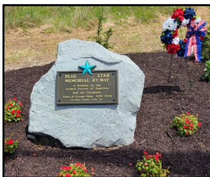
By- Way Marker

There has been positive feedback from many residents and visitors to the area. It is a great place to visit, pay your respects and reflect.